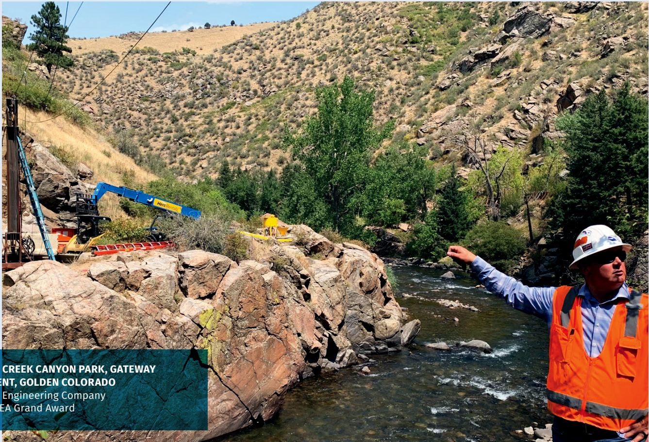
CLEAR CREEK CANYON PARK, GATEWAY SEGMENT, GOLDEN COLORADO Muller Engineering Company 2023 EEA Grand Award