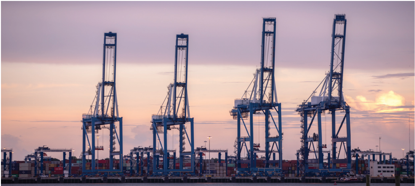
HUGH K. LEATHERMAN TERMINAL, PHASE 1 SITE DEVELOPMENT NORTH CHARLESTON, SC HDR, 2023 EEA Grand Award