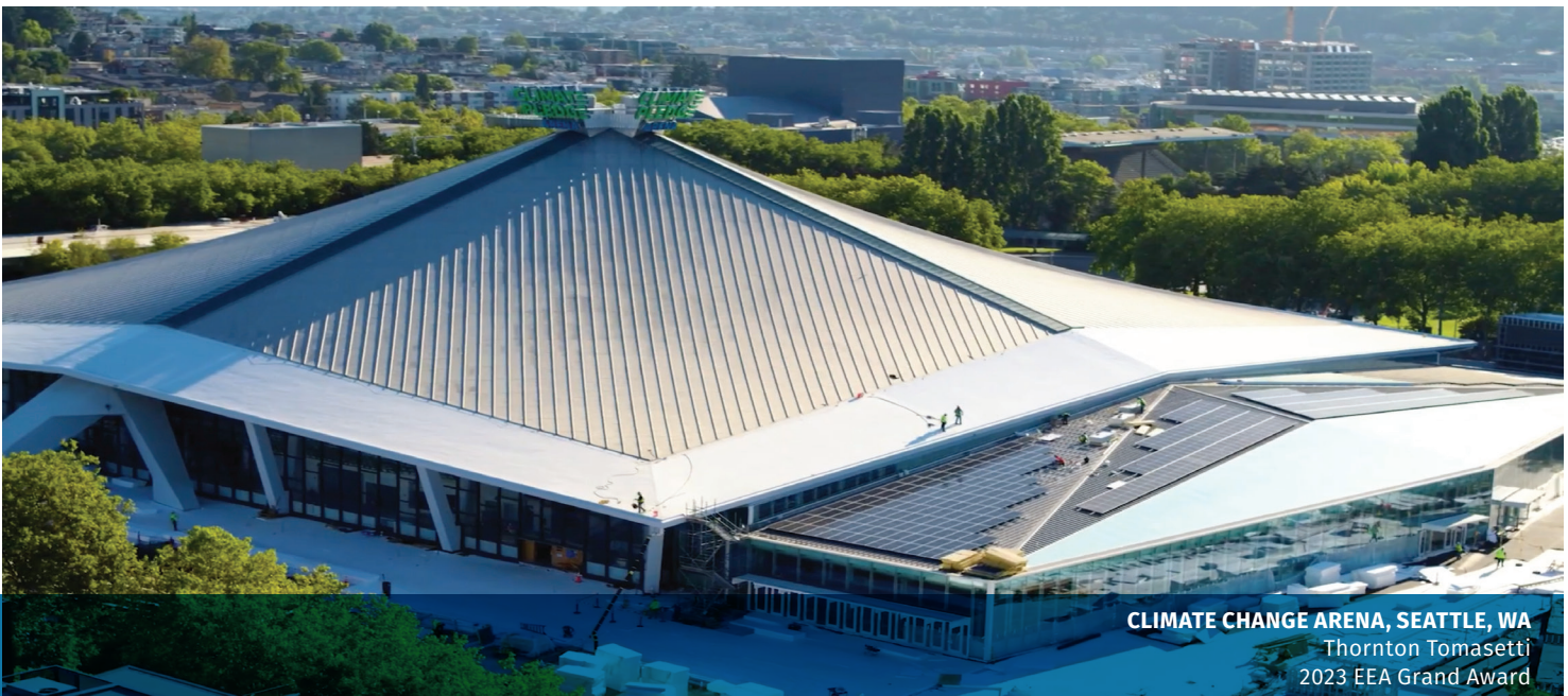
CLIMATE CHANGE ARENA, SEATTLE, WA Thornton Tomasetti 2023 EEA Grand Award