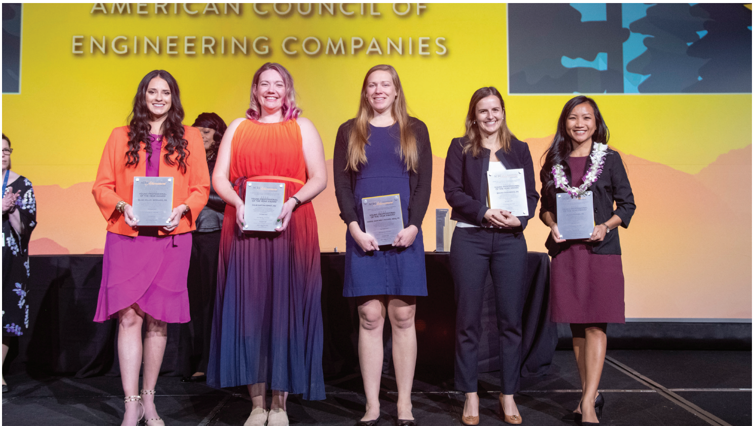
2022 ACEC YOUNG PROFESSIONALS OF THE YEAR