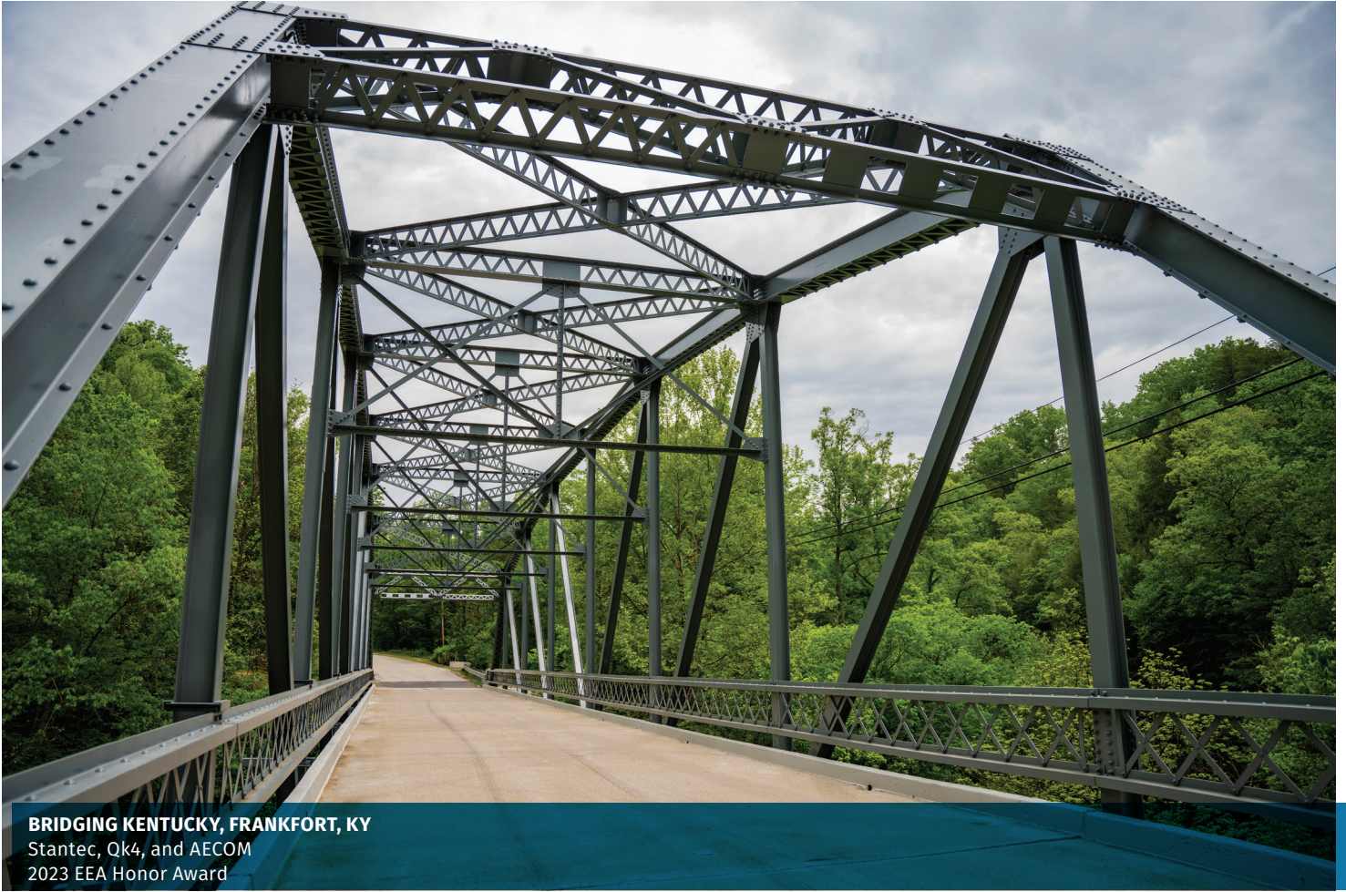
BRIDGING KENTUCKY, FRANKFORT, KY Stantec, Ok4, and AECOM 2023 EEA Honor Award