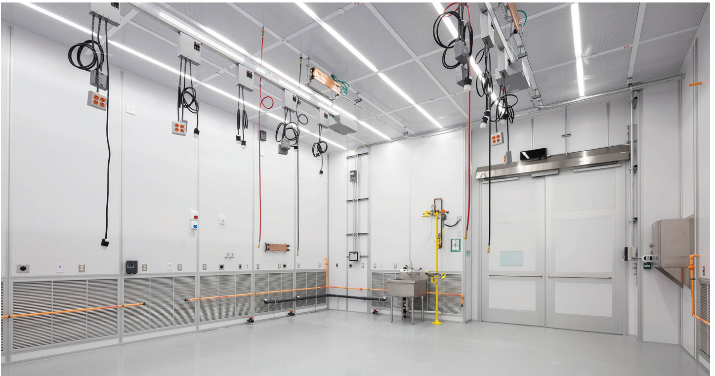
TOP: NASA LANGLEY MEASUREMENT SYSTEMS LABORATORY, HAMPTON, VA BOTTOM: NASA LANGLEY MEASUREMENT SYSTEM LABORATORY CLEAN ROOM AECOM 2023 EEA Honor Award