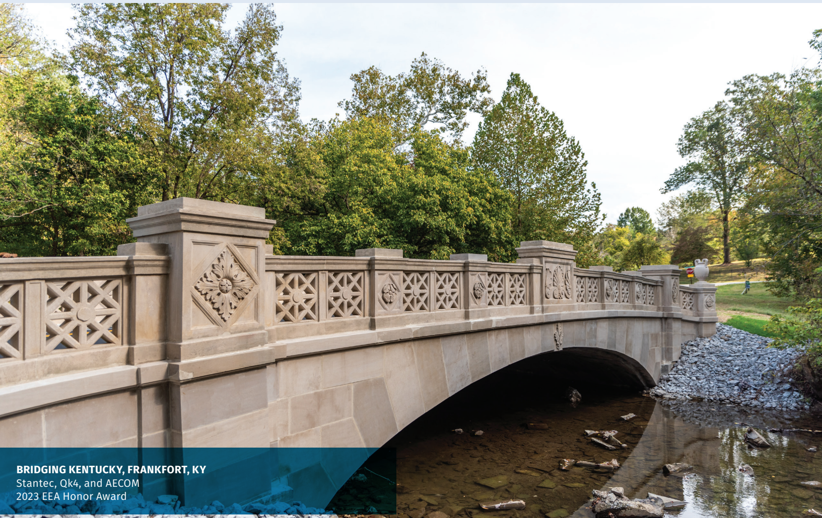
BRIDGING KENTUCKY, FRANKFORT, KY Stantec, Qk4, and AECOM 2023 EEA Honor Award