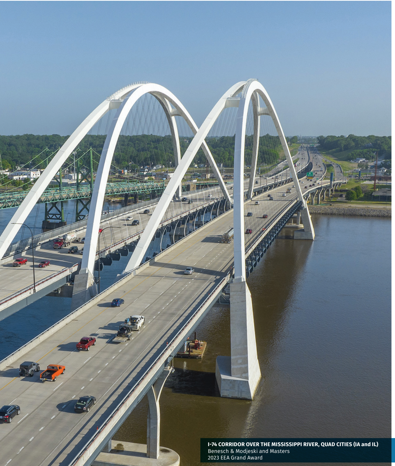
I-74 CORRIDOR OVER THE MISSISSIPPI RIVER, QUAD CITIES (IA and IL) Benesch & Modjeski and Masters 2023 EEA Grand Award