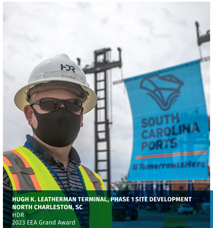
HUGH K. LEATHERMAN TERMINAL, PHASE 1 SITE DEVELOPMENT NORTH CHARLESTON, SC HDR 2023 EEA Grand Award